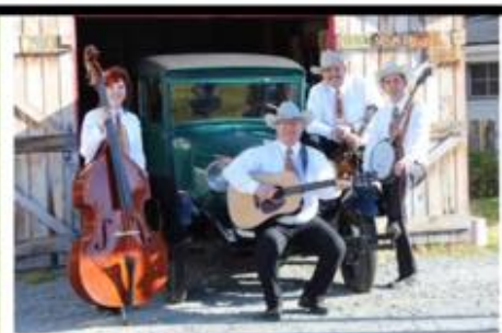
Bluegrass Tradition Nova Scotia

Book your Room/Ticket Package by calling the Hotel at 1-800-565-7829 for Room/Weekend/2 Tickets Package