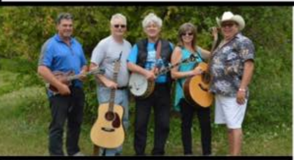
Sweet Grass Band Roseneath, Ontario